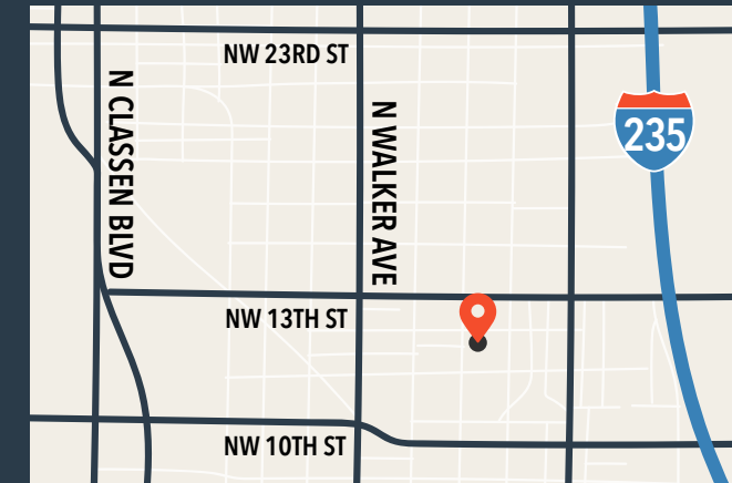
Located on SW corner of NW 12th St & N Harvey Ave