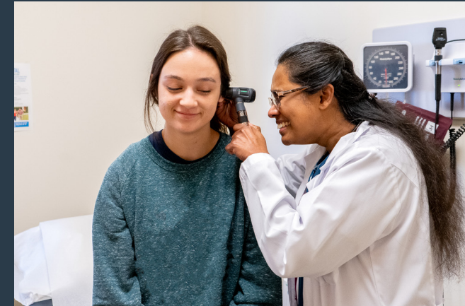
Second location providing medical, dental, and vision services