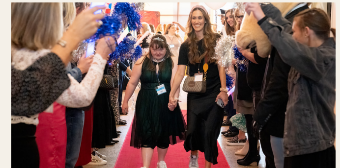
Crossings engages community as Night to Shine host.

DON'T FORGET TO DO GOOD AND TO SHARE WITH THOSE IN NEED. THESE ARE THE SACRIFICES THAT PLEASE GOD.