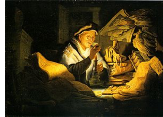
The Parable of the Rich Fool, Rembrandt 1627