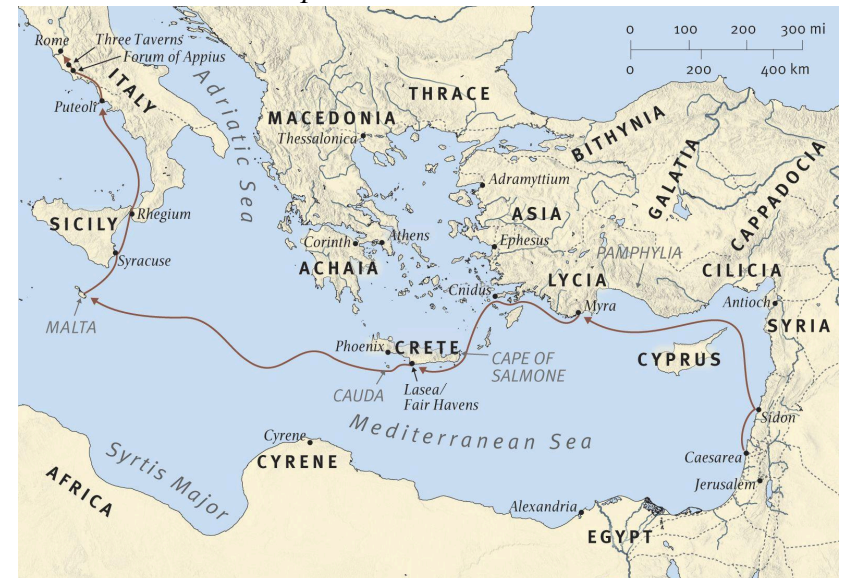
Paul's Journey to Rome, under Roman arrest, ca. 60 AD (The letter to the Roman Christians dated ca. 56 AD)