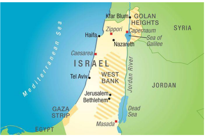
Israel, Hamas, Hezbollah, and the Palestinian Authority